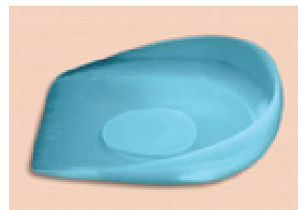
Soft heel pads can provide extra support.

Complication rates for gastrocnemius recession are low, but can include nerve damage.